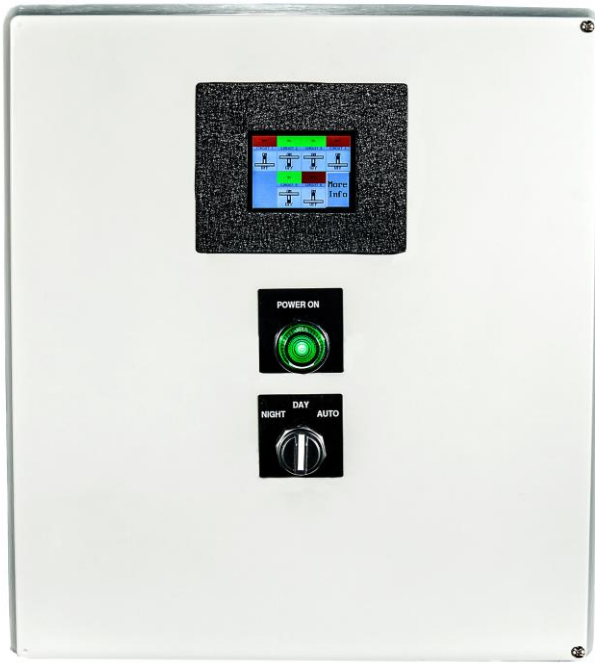
COLOR TOUCHSCREEN Typical Display Touch the switch to change circuit state