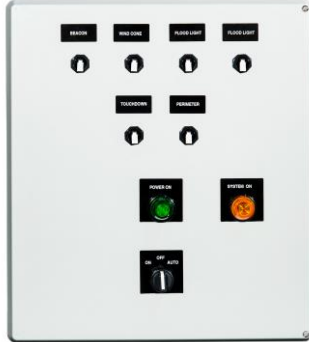
HELIPORT LIGHTING CONTROLLER PHC-61001-AC-TS With color touchscreen